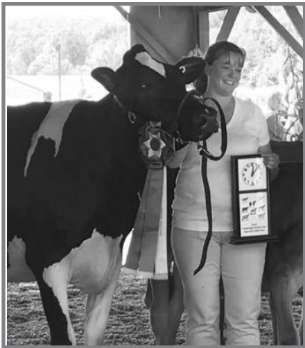
Farmstead Genetics Howacres G D Margarita - ET Holstein