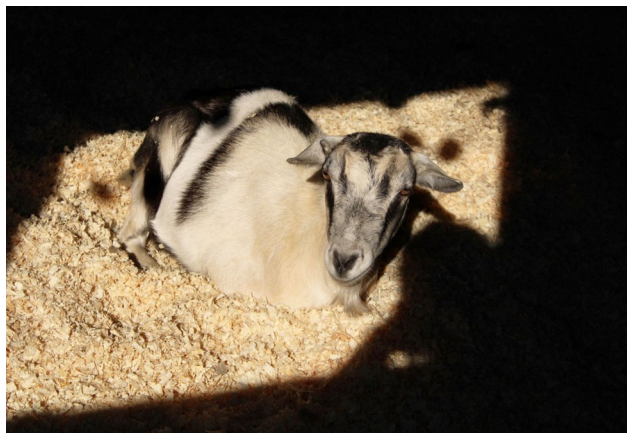
Feta Alpine goat from Hummingbug Hillfarm Feta has been pillaging and picking pockets in the Sheep and Goat Department for many years. Secure your consumables!

Participation in run-off categories including Champion Meat Goat, Champion Fiber Goat, Champion Dairy Goat, Champion Homestead Goat, and Best in Show are by judge's invitation and may involve multiple animals from a breed or class. An individual animal may be eligible for multiple run-off categories.