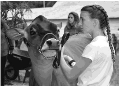
Annie Burke Memorial Award Grand Champion Ayrshire ALW Aclaim Ginney Gilead Brook Farm