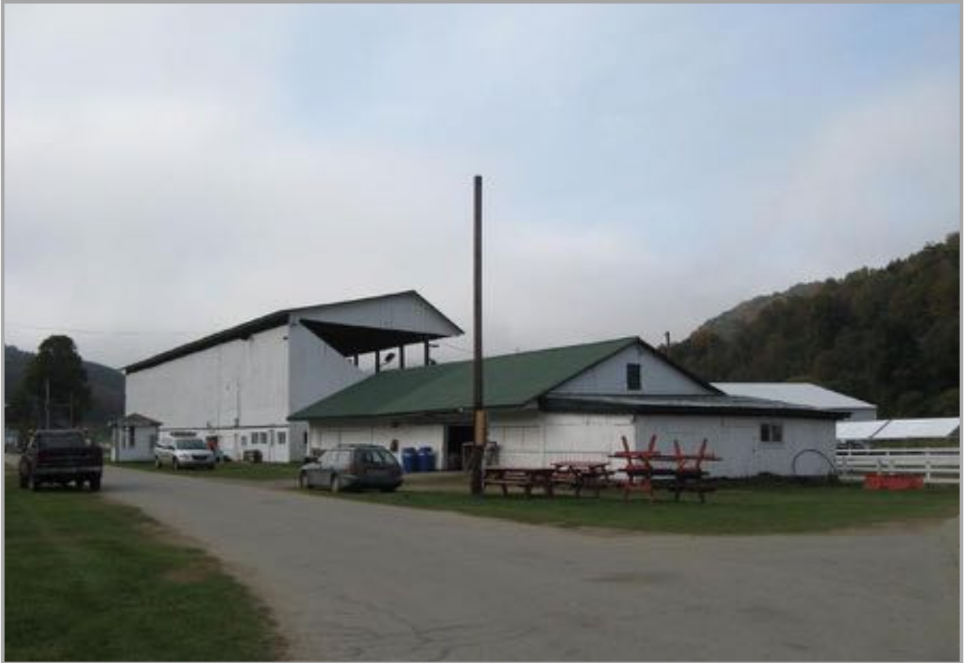
Brooksie's or the Bingo Hall

Demolished April 2020 to prepare site for replacement building with support from the state of Vermont Capital Grant program through the Agency of Agriculture