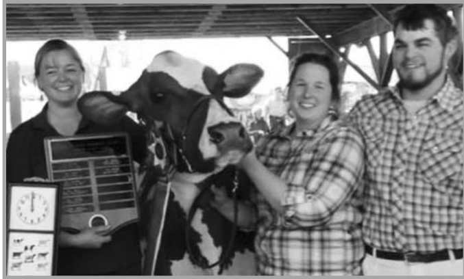
2019 James K. Howe Memorial Award Supreme Dairy Cow AYRSHIRE ALW Aclaim Ginney Gilead Brook Farm